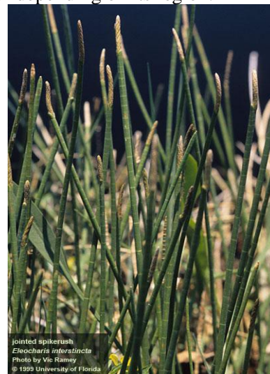
jointed spikerush Eleocharis interstincta

Spikerush is considered to be one of the largest specimens of the rushes. It is also found in Alabama, Texas, parts of New York and in the West Indies. It grows to 4 feet tall and is a cylindrical "reed" like plant that inhabits freshwater areas. This perennial has whitish flowers that are inconspicuous but plentiful; it blooms during the spring and summer depending on its region.